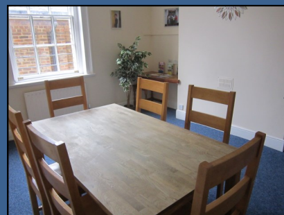
Halfway Meeting Room